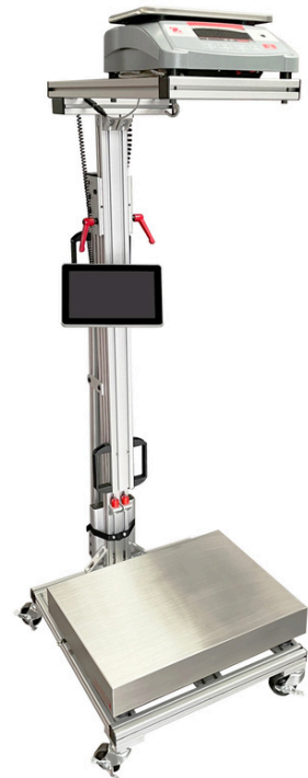
*Shown with all options